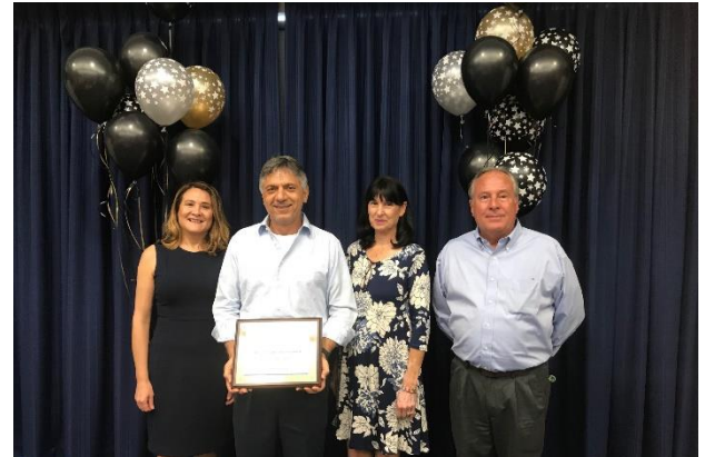
Paris Air – Small Company of the Year