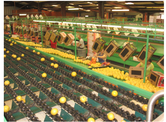
Riverfront Packinghouse, Vero Beach