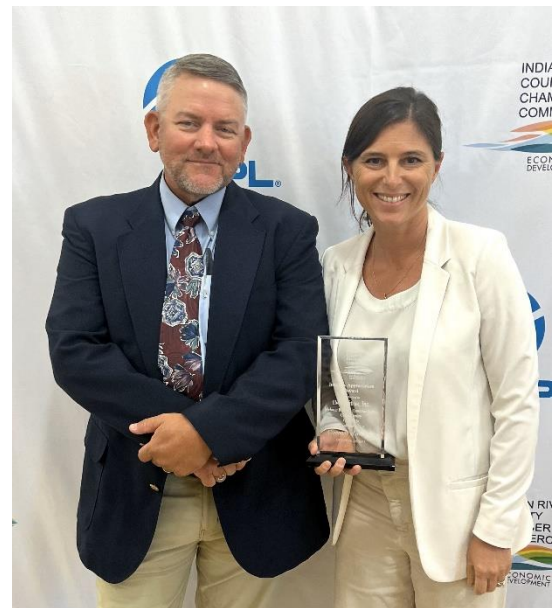
2023 Large Company of the Year: IMG Citrus

We ask that previous award recipients in the above categories allow for 5 years to pass before submitting nominations for the same category.