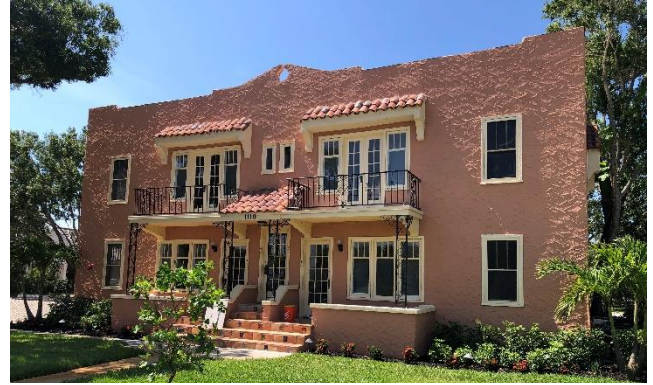
2023 Architectural Recognition/Historic Restoration: Tangelo House, Vero Beach

* Certificate of Occupancy or Certificate of Completion must be issued between 8/1/2023 and 7/1/2024.