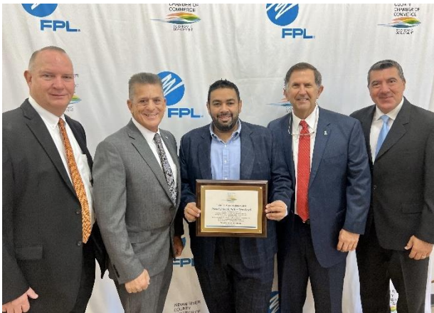
2023 Architectural Recognition/Large New Construction: Home2 Suites by Hilton-Vero Beach