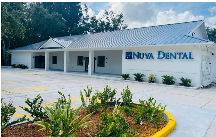
2023 Architectural Recognition/Adaptive Re-Use: Nuva Dental, Vero Beach