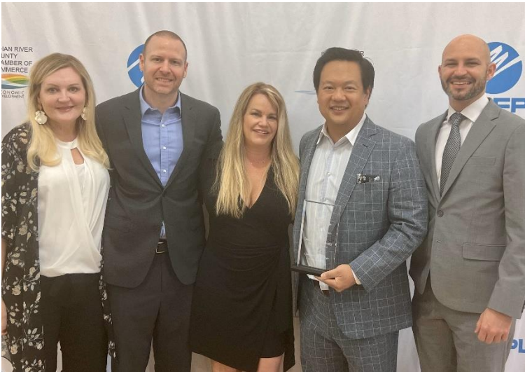
2023 Mid-Size Company of the Year: Ocean Drive Plastic Surgery