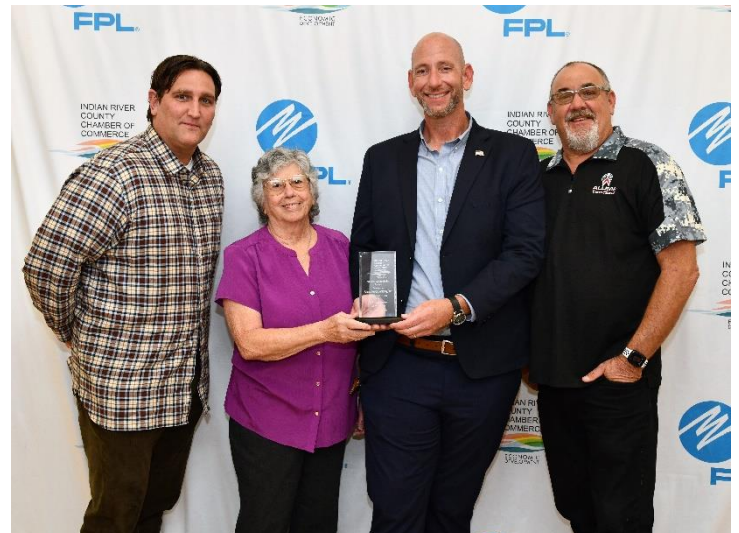
2023 Small Manufacturer of the Year: Aluma Tower, Inc.