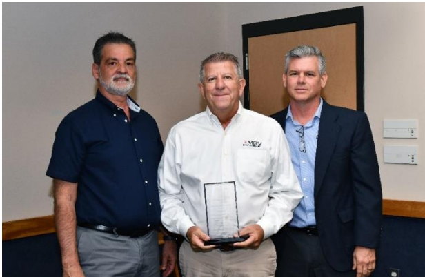
2023 Small Company of the Year: MBV Engineering