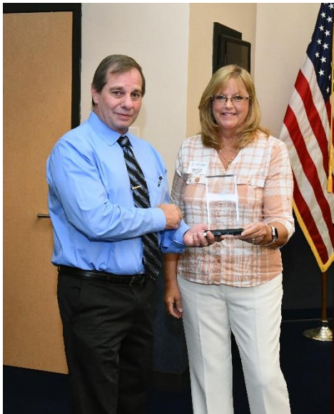
2023 Large Manufacturer of the Year: MA Ford, Inc.