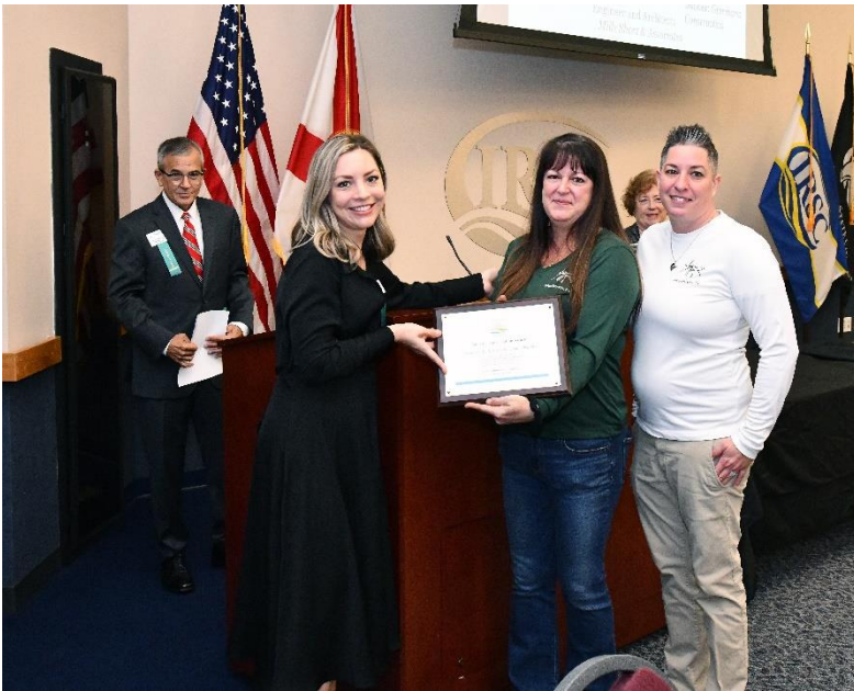
2023 Architectural Recognition/New Construction: Max's Tiki Bar at the Green Marlin