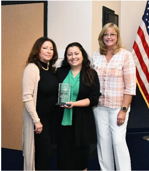
2023 Entrepreneur of the Year: Armani's Cucina and Armani's Italian Market