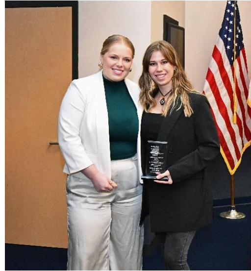
2023 Minority Business of the Year: Cooley Creative