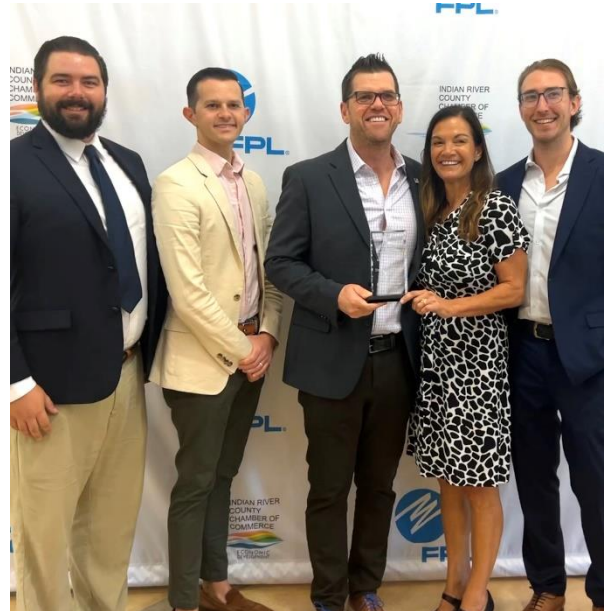
2023 Veteran-Owned Company of the Year: 21 st Amendment Distillery